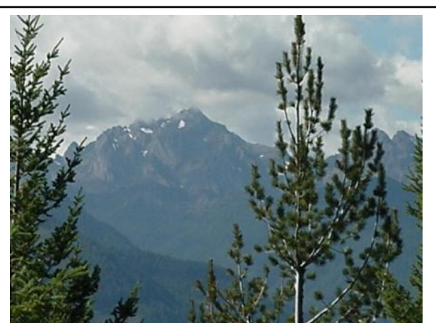
View of Mt. Constance from Mt. Walker north summit viewpoint

PASS NOT REQUIRED: A Recreation Pass is NOT REQUIRED at this trailhead.